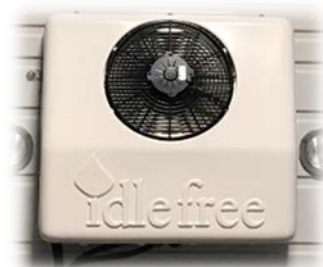
Dirty Condenser Coil

When coils become dirty, they become inefficient and fail to properly cool the sleeper. Remove the cover from the condenser and use low-pressure water to rinse debris from the coil. Finish by rinsing all surfaces to remove salt deposits.