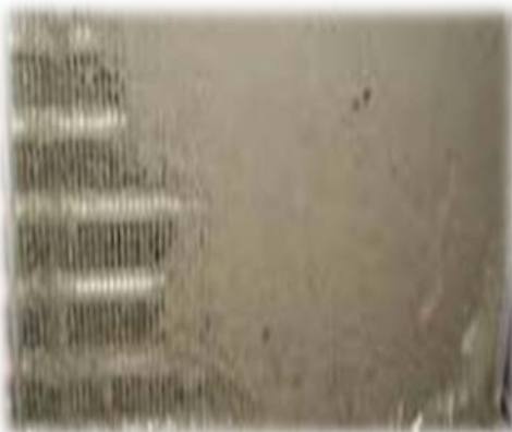
Dirty Condenser Coil

When coils become dirty, they become inefficient and fail to properly cool the sleeper. Remove the cover from the condenser and use low-pressure water to rinse debris from the coil. Finish by rinsing all surfaces to remove salt deposits.