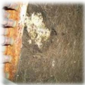
Evaporator plugged with hair

Don't overlook the evaporator just because it's inside the truck. Pet hair and other debris will plug the coil and filter. Remove and clean the evaporator filter by running water over it. Use a vacuum to remove hair and debris from the evaporator coil.