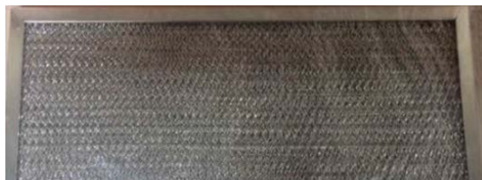
Clean evaporator filter