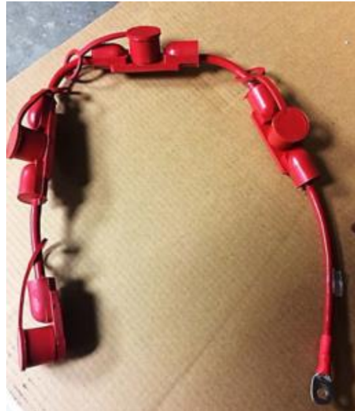
Sealed Cable Gang - 32062