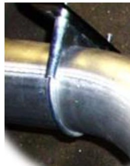
Truck Mounting Clamp