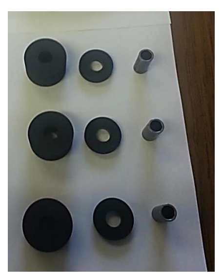
Compressor Feet Parts